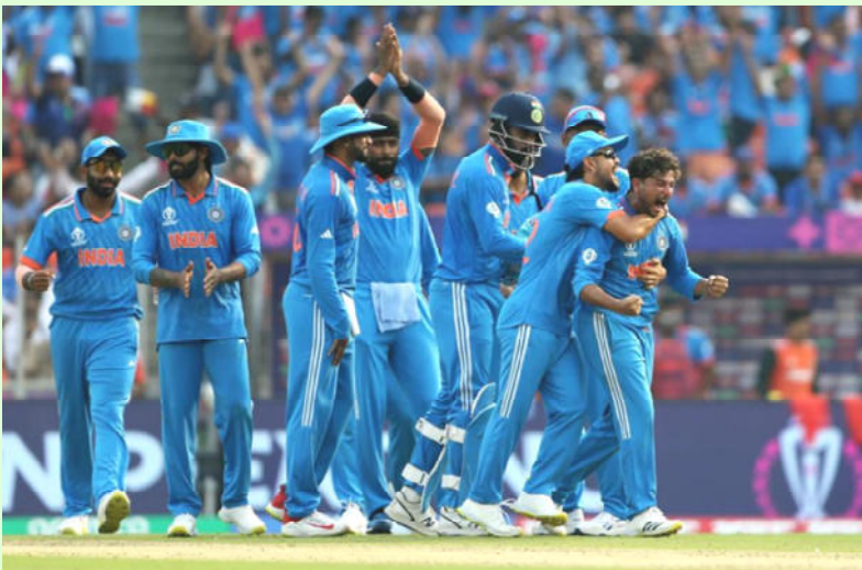
Jasprit Bumrah, Mohammed Siraj, Hardik Pandya, Kuldeep Yadav and Ravindra Jadeja took two wickets each for the hosts. Jasprit Bumrah was declared man of the match.

Earlier, put to bat first, Pakistan were bundled out for 191 in just 42.5 overs. Captain Babar Azam with 50 runs and Mohammad Rizwan with 49 runs were top scorers for Pakistan.