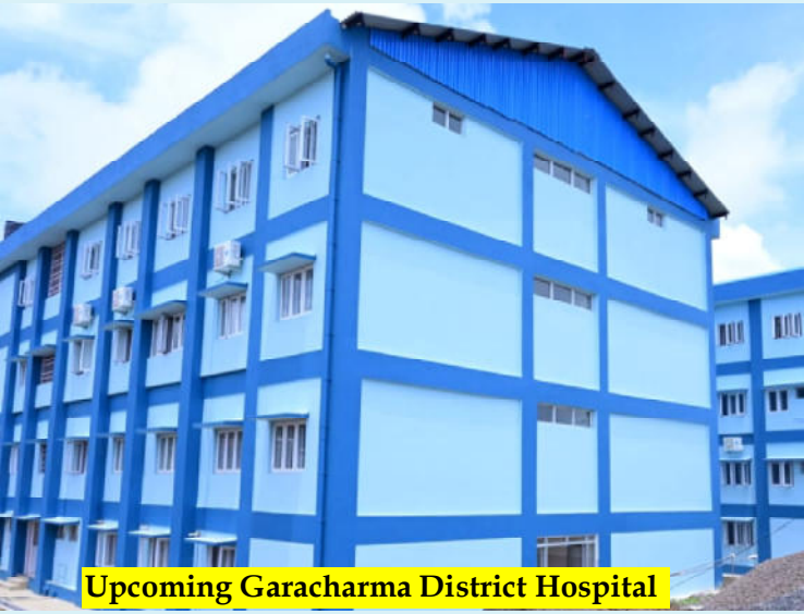
Upcoming Garacharma District Hospital

vacancies in Health Department? Secretary (Health): There are different categories of posts in Health Department viz. Group A, B & C posts. Doctors and Specialists comes under Group A post, Nursing Officers come under Group B posts and in Group C, other supporting staff viz. ANMs, Para Medical Worker etc. Recruitment for Doctors and Specialists on contract is under process. Further, stage 1 recruitment for Group B & C will be completed in next two months in which all the vacant posts will be filled and the required manpower will be available in all the Islands.