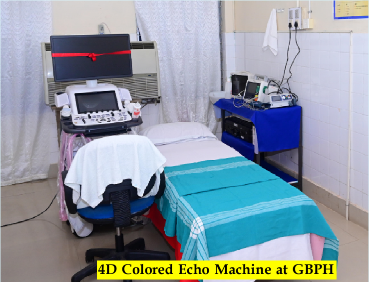
4D Colored Echo Machine at GBPH

Secretary (Health): The facility of Blood Bank is available in three places in Port Blair as of now i.e. G.B Pant Hospital, INHS Dhanvantri and in private hospital Pillar Health Centre. The Department has devised a plan to set up a Blood Storage Centre facility in all District Hospitals, Community Health Centres and Primary Health Centres. The Department urges blood donors